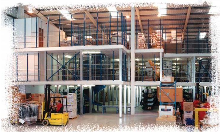
Two tier floor