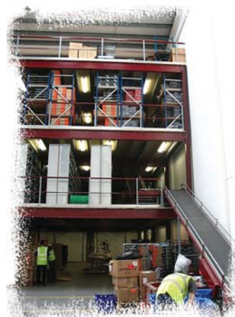
Three tier floor